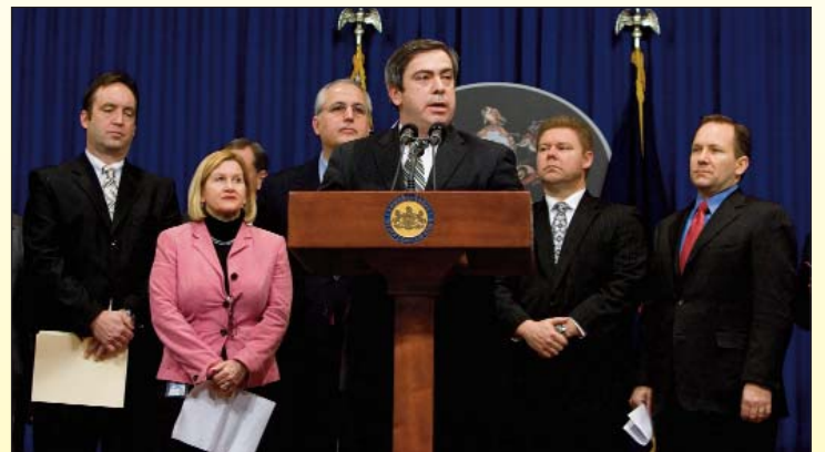
Speaking at a January 21 press conference hosted by Senate Republicans to unveil a 10-bill government reform package, Senate Finance Committee Chairman Pat Browne (R-16) discusses his proposal to create a searchable online budget database.

ernment reform and other state issues can be found on the Senate Republican Caucus web site, www.pasenategop.com .