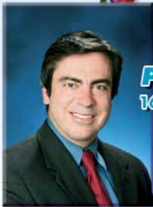
Senator Pat Browne 16th Senate District